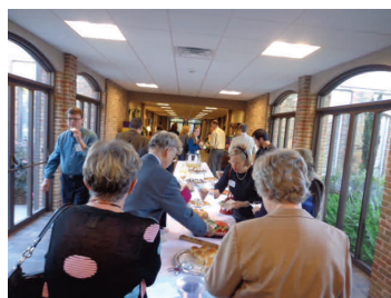
Guests enjoy the post-concert reception