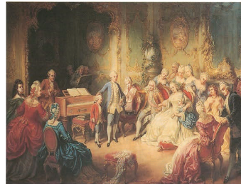
The young Mozart being presented to Empress Maria Theresa.