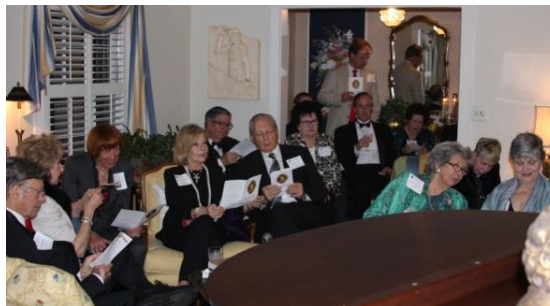
Pro-Mozart Patrons & Board Members readying for program